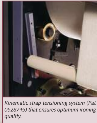
Kinematic strap tensioning system (Pat 0528745) that ensures optimum ironing quality.

The superior finished results make Girbau flatwork ironers the leaders in industrial flatwork ironing applications. The most discerning client of a hotel or a restaurant can quickly recognise the use of Girbau machines through the highest quality finished table and bed linens.