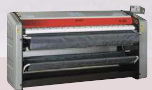
Option: Mars red