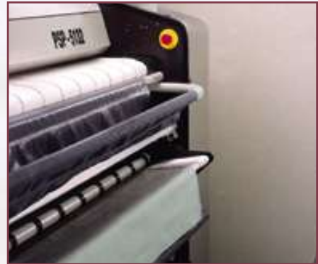
Primary folder applicable on model PSP-51