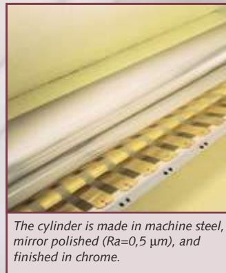
The cylinder is made in machine steel, mirror polished ( Ra=0,5 \mu m ), and finished in chrome.

The installation of an extractor fan, to pull evaporated moisture away from the cylinder, and NOMEX ironing straps, prevent straps from remaining moist while ironing, thus extending the life of all feed and compression material components.