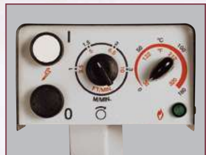
PS-2212 Electromechanical control.