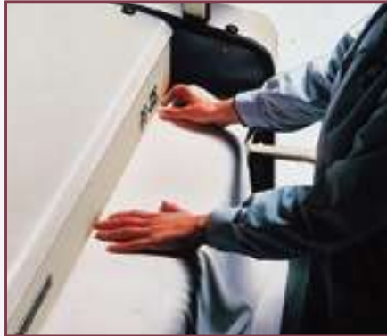
Hand guard protection with double sensor to control the active and rest position

If power goes off, the items in process can be manually removed, preventing possible damage.