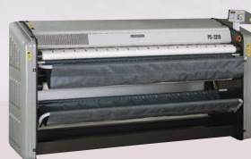
Basic: Saturn grey