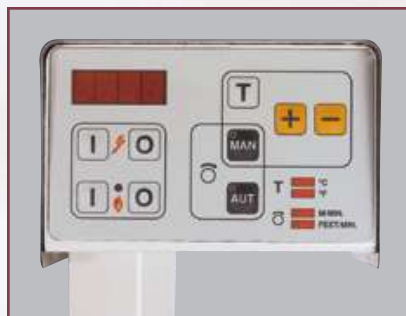
PS-32 Programmable Microprocessor control.