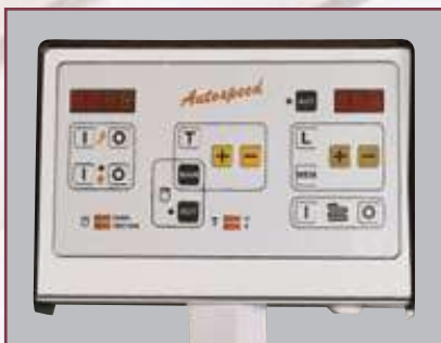
PS/PSP-51 Programmable Microprocessor control.

For model PS-2212, providing appropriate control of all the parameters, incorporating speed adjustment control, heating indication LED, and thermostat for temperature adjustment.