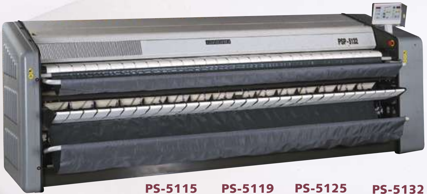
PS-5115 PS-5119 PS-5125 PS-5132 PSP-5115 PSP-5119 PSP-5125 PSP-5132