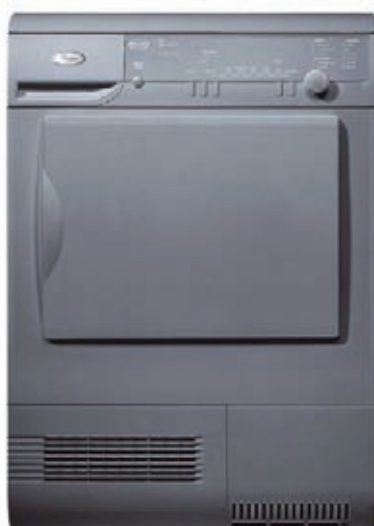
Series 6 HDD6710 Pewter Dryer