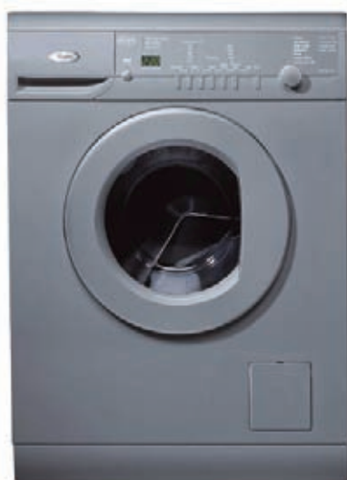
Series 6 HDW6100 Pewter Washer

If you're looking for the benefits of enhanced wash capacity but only have the space for a conventional machine then this is the model for you. Compact 6kg (13lb) capacity front loading washer with 1400 rpm spin speed, stylish pewter finish, Aquastop security system and matching (stackable if required), 6kg (13lb) front loading electric dryers.