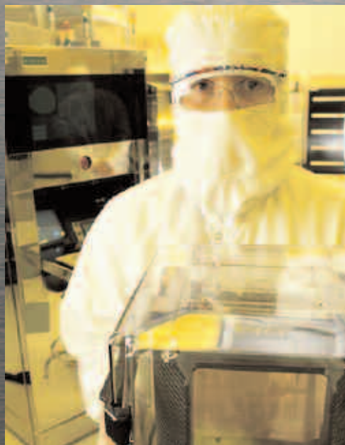
Exceeding the highest standards.

ADC's Solaris line is the result of intelligent design, engineering and manufacturing. Offering the most durable construction of any dryers available on the market, they are built for long life and continued return on your investment.