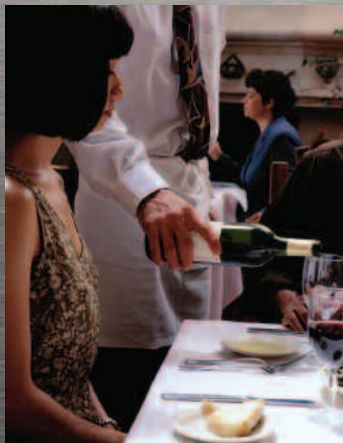
Optimize drying operations, with style.

Solaris improves the state of commercial drying in virtually every way. The Solaris line advances energy efficiency, performance, durability, usability and style as only ADC can. At the center of the achievement: energy savings of up to 30%. And that is just the start of a full spectrum of ownership benefits. We invite you to see drying technology in a whole new light.