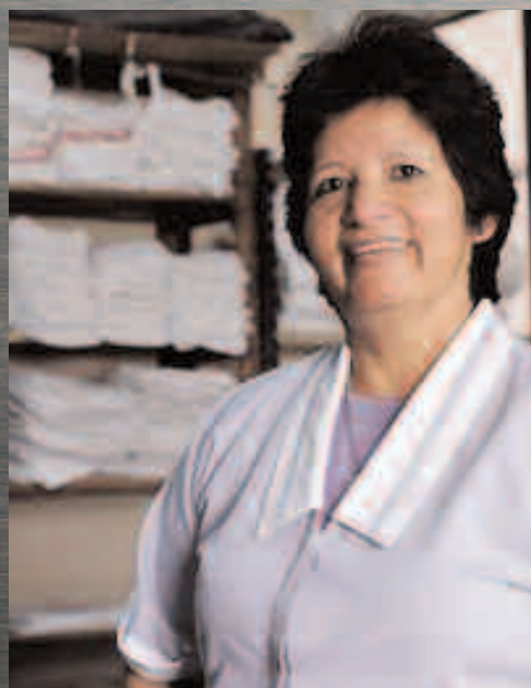
Results you can count on for the long run.

The Solaris line was unquestionably built for the demanding, round-the-clock needs of commercial operations. By creating machines with your needs in mind, ADC offers you dryers with more of what you want in terms of dependability, energy savings, drying speed, serviceability, convenience and safety.