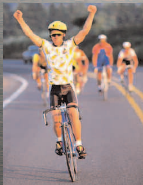
Other dryers are simply no match.

Industry-leading energy savings, drying performance, safety and numerous standard features make one thing very clear: Solaris drying tumblers don't compete with other dryers, they make other dryers obsolete.